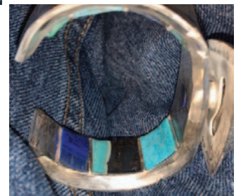
Turquoise, Lapis, and Blue Wood Opal in Sterling Inlay Cuff