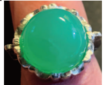
Chrysoprase in a Sterling Silver Ring