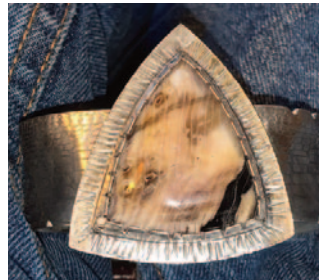
Hells Canyon Petrified Wood in Sterling Inlay Cuff