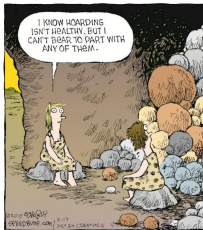
Used with Permission ©Dave Coverly/speedbump.com