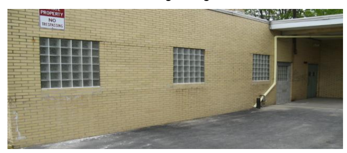
The new glass block windows and glass block/concrete block replacement for the mechanical room door.

This week there were big changes, both inside and out.