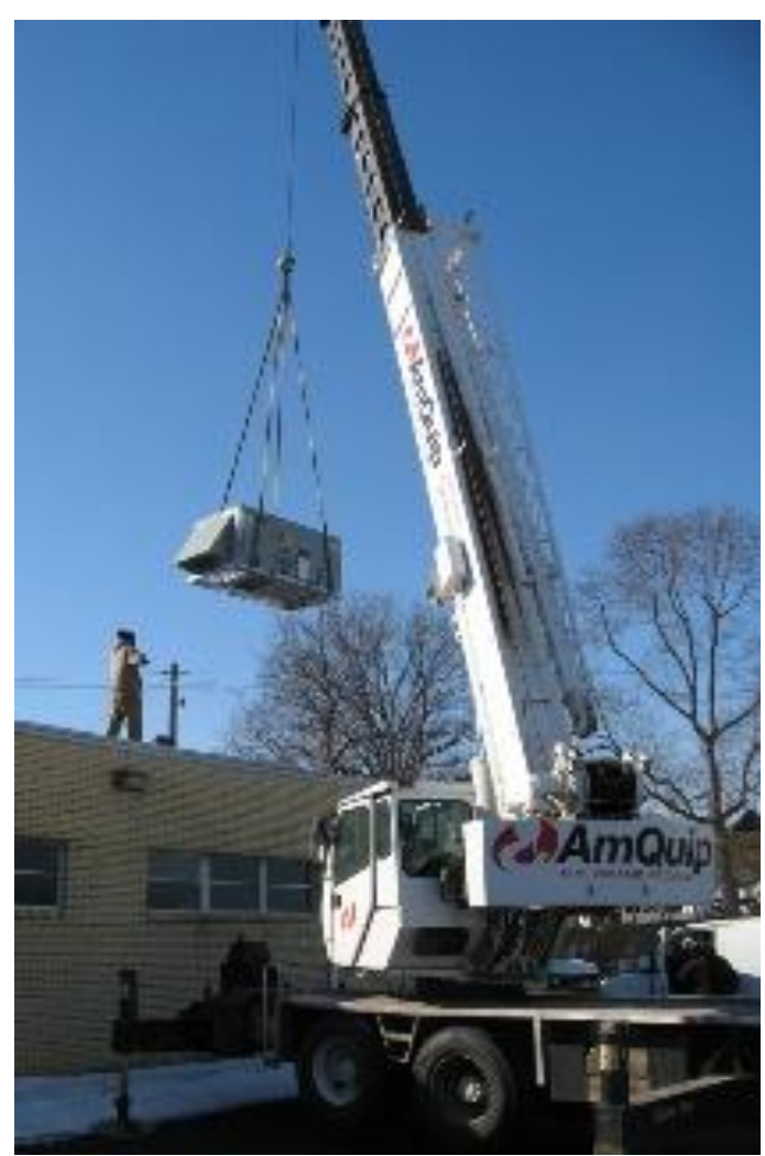
The new HVAC unit is placed.

On Wednesday, I received word from the roofing company that we have 4" of concrete on the roof so no-one will ever break in through the roof! They found cutting through with diamond saws difficult. A beam for the storage room ceiling and a supply of lumber for interior door and window lintels was delivered.