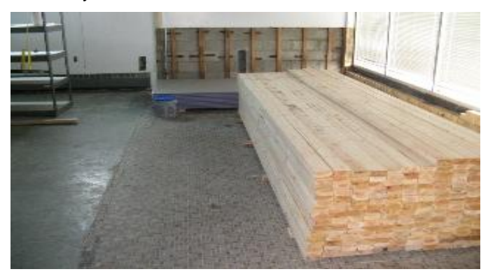
Our 'green-board' and 2×4s are delivered.

On Tuesday, 1/25/11, most of the new plumbing for the handicap-accessible bathroom was roughed in by the bathroom contractor. Also work on natural gas lines to the jewelry room and to the new HVAC unit was started by the HVAC contractor.