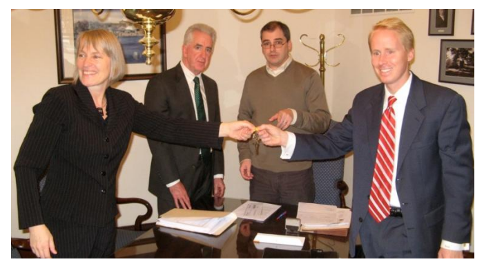
... and receives the keys to 24 Upland.

To make our facility truly "state of the art" and have wonderful new equipment and tools that we are all