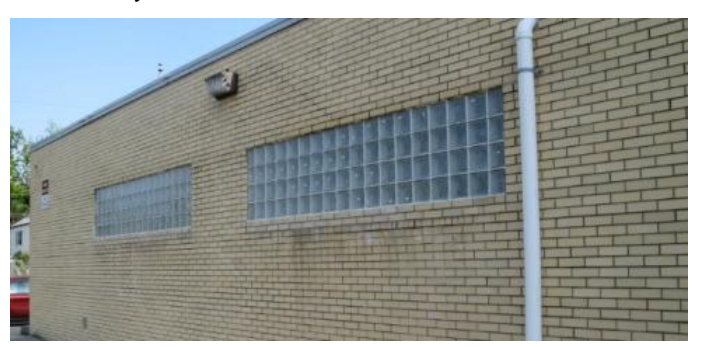
Glass block is installed to replace the windows on the side of the building.

On Thursday, Doug Klieger and I installed two of the interior glass block windows while Pete and Gayle Flaer continued work on the storage room shelving. Our mason prepared the area below the window frame in the office/library for us to install tile and a sill.