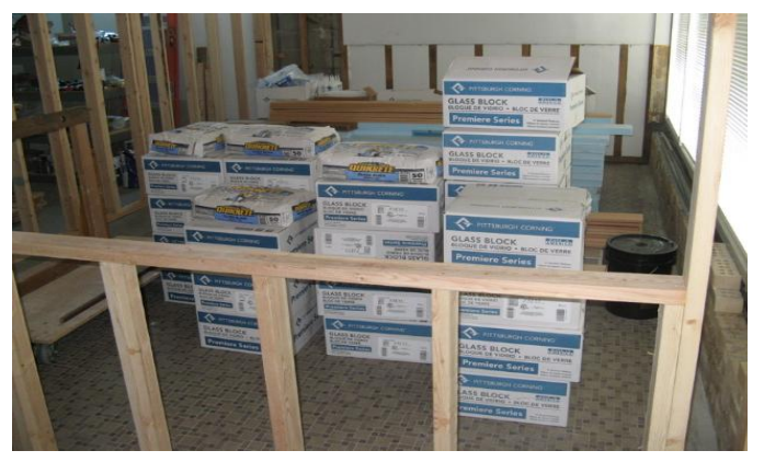
The glass block arrives and is quickly unloaded.

Charlotte did a great job applying primer and a finish coat of paint to the storage room. Pete and Pam cut baseboard trim for the storage room and Pam applied three coats of polyurethane. Pam also marked wall stud locations on the floor so that they'll be easy to locate once drywall is applied. Bill did some cement patching in the new bathroom and helped me mark the floor for placement of the remaining walls that we have yet to frame. Joe did a great job removing some of the old drywall where one of our new walls will attach to the masonry and doing some chisel work on the opening to the mechanical room. Don installed an exhaust fan for the new bathroom and supplied lighting to all but one of the rear rooms — a great help!